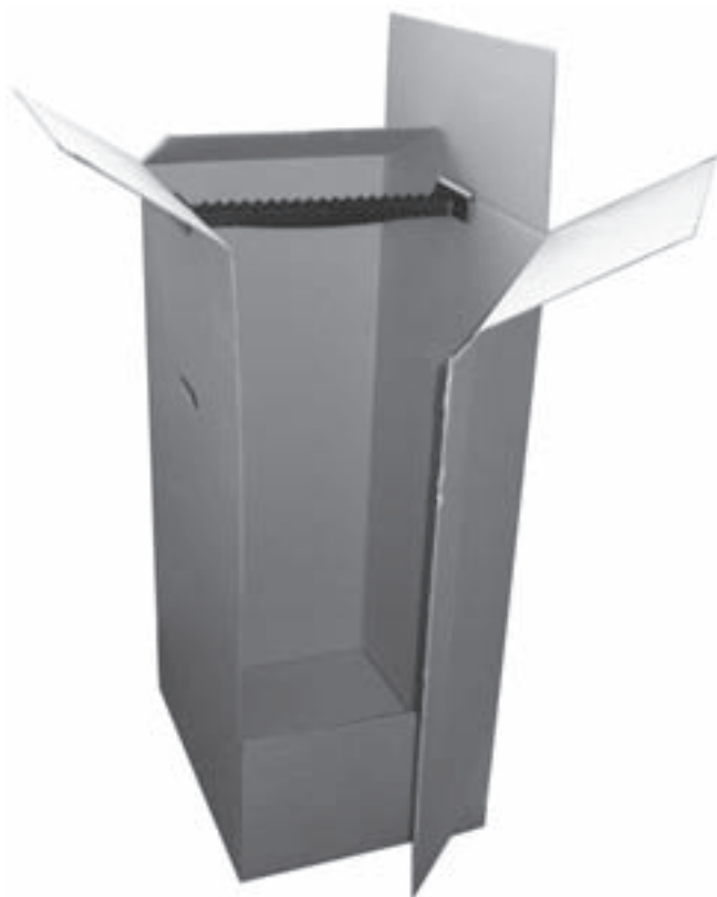
Master Rail in use in a wardrobe removals box