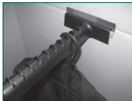
Master Rail ribs prevent movement of garments in transit