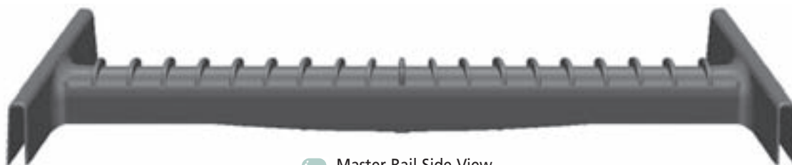
Master Rail Side View