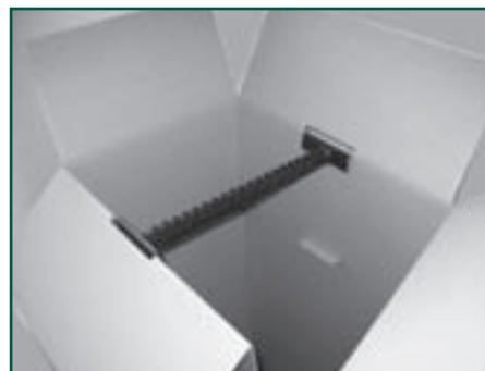
Master Rail is easy to fit